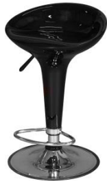
Barstool BS16A Max: 490W x 860H mm Min: 400W x 660H mm