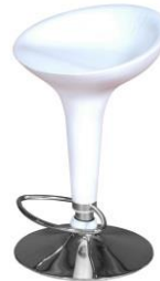
Barstool BS16B Max: 490W x 860H mm Min: 400W x 660H mm