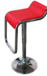
Barstool BS11B (Red) 385W x 455D x 880H mm