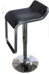
Barstool BS11A (Black) 385W x 455D x 880H mm