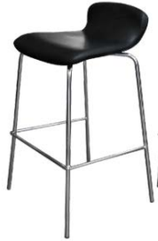
Barstool BS10 (Black) 445W x 485D x 880H mm