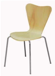
Bentwood Chair MC16 490L x 610W x 830H mm