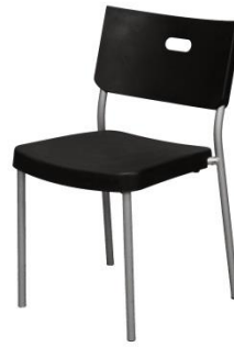
Multi-purpose Side Chair MC10A 450W x 440D x 760H mm