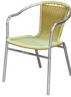
Café Chair MC17C 570Wx 720D x 740Hmm