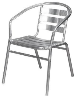
Aluminium Chair w/ Arm MC17A 570Wx570Dx740Hmm