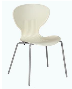
Curved Chair MC16 (W) 450Wx460Dx830Hmm